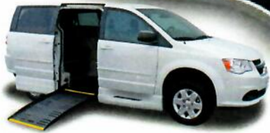
ADA Accessible Van